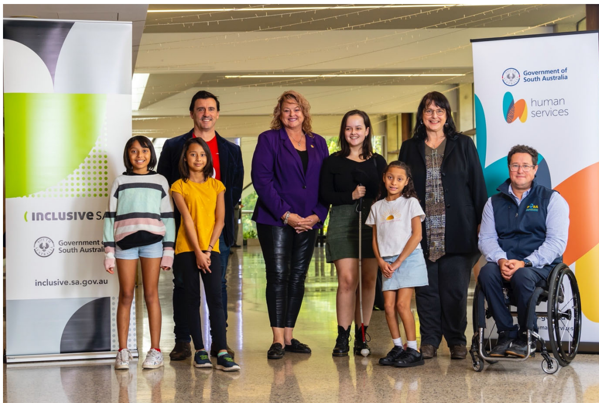
Image: Pavely app launch attendees standing together for a photo.

https://dhs.sa.gov.au/news/media-releases-2022/pavely-paving-the-way