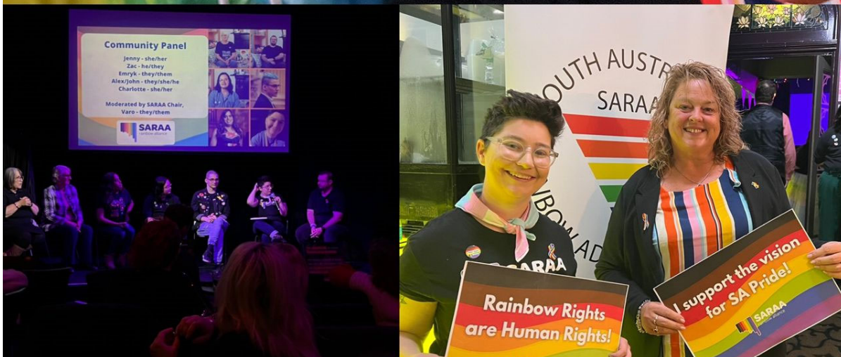
Image: Nat celebrating IDAHOBIT alongside members of the LGBTIQ+ community.