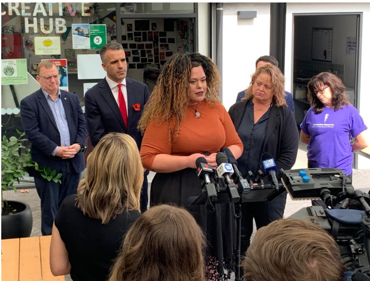
Image: Nat standing with the Premier, sector employees and others at a media conference.