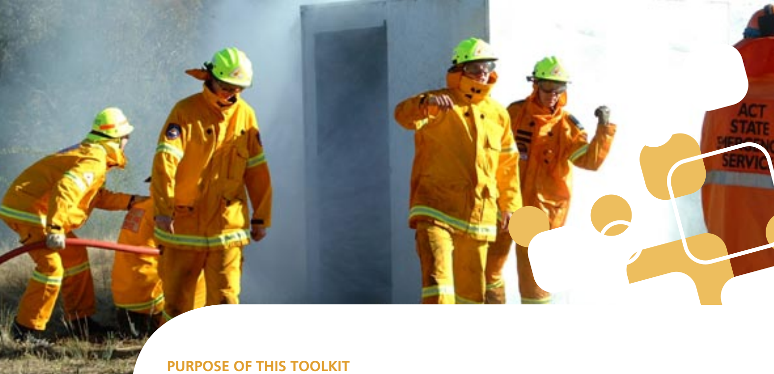
Members of the ACT Rural Fire Service and SES participate in a structural fire protection scenario.

Being able to work out whether your volunteers need training and what their training needs are is a key skill for managers of volunteers and not-for-profit organisations.