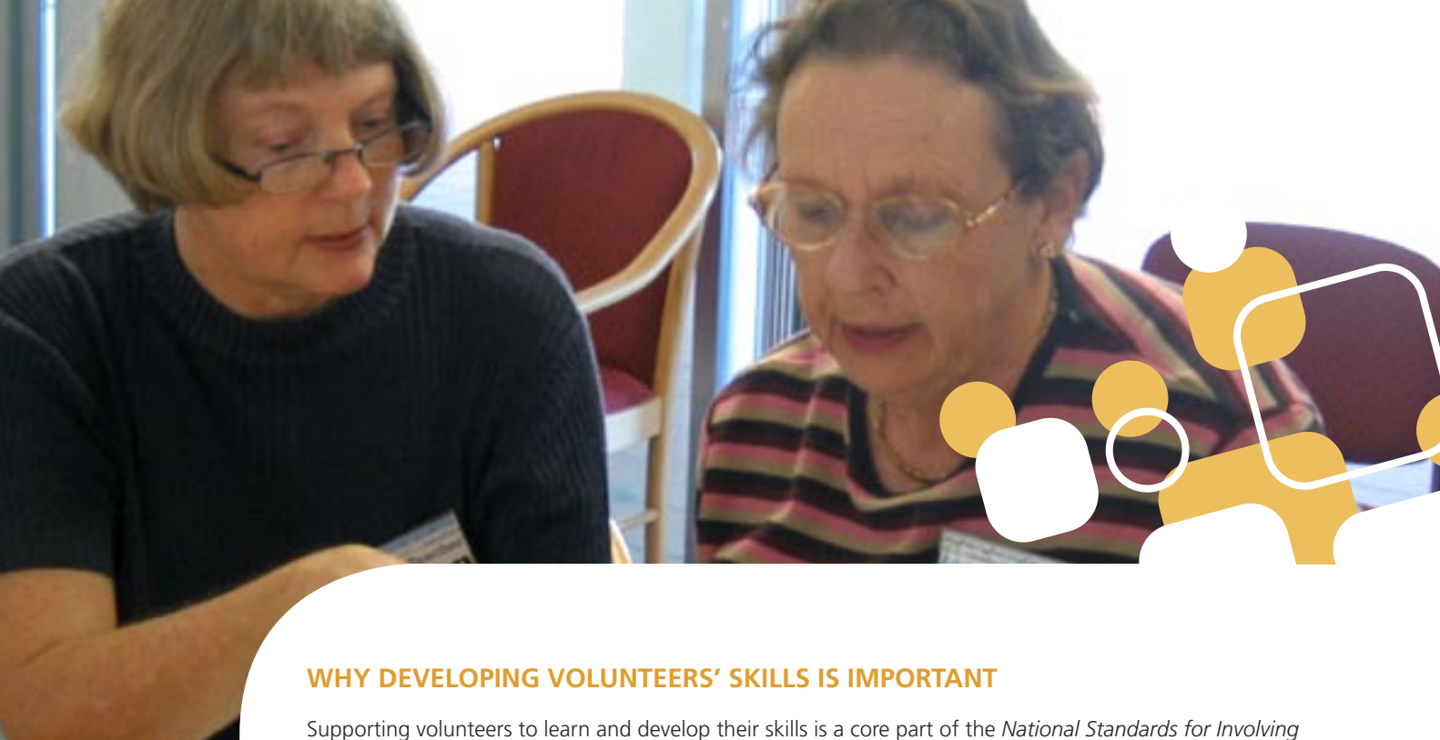
Image courtesy of the Caloundra City Libraries Adult Literacy Program – 2005 NAB National Volunteer Awards National and State Winner (Qld) for Education and Youth Development.

Supporting volunteers to learn and develop their skills is a core part of the National Standards for Involving Volunteers in Not for Profit Organisations , with Standard 5 stating that 'an organisation that involves volunteers shall ensure that all volunteers obtain the knowledge, skills, feedback on work, and the recognition needed to effectively carry out their responsibilities'.<sup>1</sup>